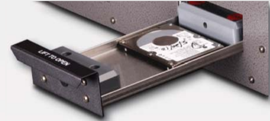
Laptop Hard Drives