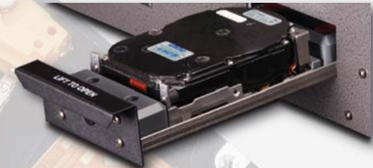
1.5" Hard Drives